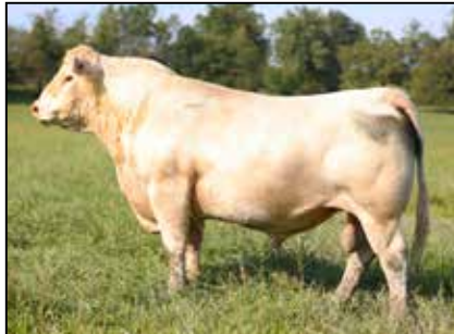
RF LEDGER 439 Progeny sells

Calved 1-2-21 with Outlier Bull Calf. Daughter sells as Lot 94, and another daughter remains in herd. Top 20% Milk & MTL and Top 2% Fat.