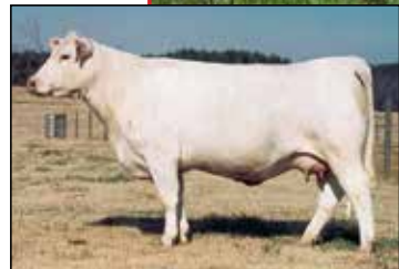
JWK CLARICE J139