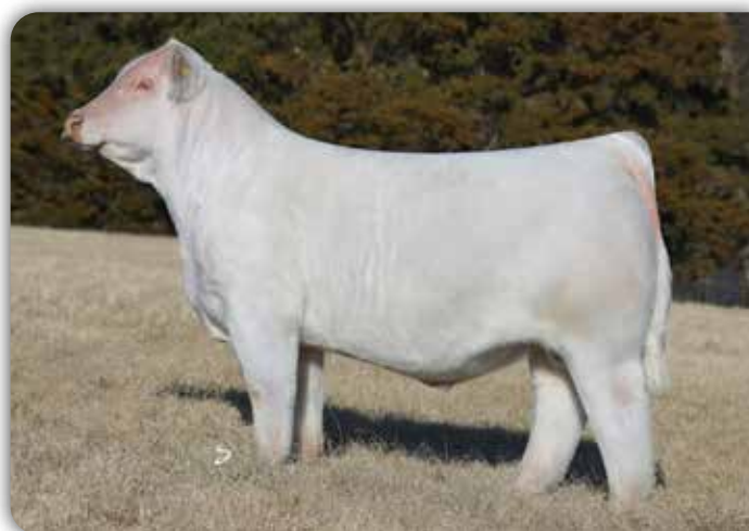
BOY OUTLIER 812 ET PLD Sire of Lots 1-15