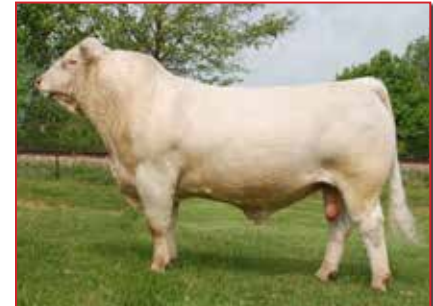
MEAD-RF X-FACTOR G584

Calved 12-24-20 with Authority Bull Calf. Top 8% Milk, Top 10% MTL and Top 30% MARB.