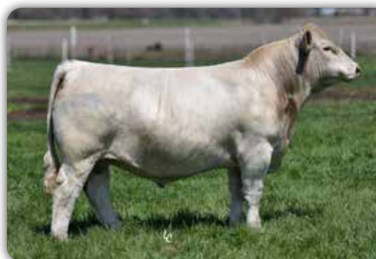
WR FOREMAN D602