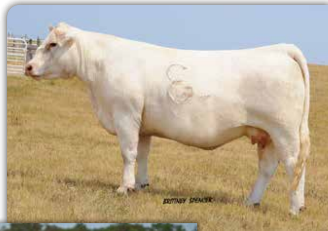
3G COWGIRL KQUISITE Dam of Lot 1