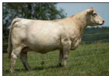
RF-ACE MS NANCY 7711