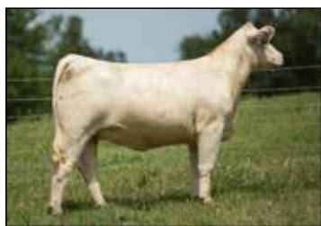
MATERNAL SISTER to Lot 91

Calved 12-23-20 with Authority Bull Calf. Maternal sister sold to Bina Charolais in our last Family Values Sale. Top 4% Milk, Top 5% MTL and Top 15% REA.