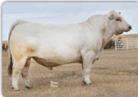
M&M OUTSIDER 4003 PLD Sire of Lots 16-22

LT SILVER DISTANCE 5342P LT BELLE 7026 P M&M RAPTOR 8122 PLD MS COOLEY JPOT 1107N9 ET LT RIO BLANCO 1234 P LT 7N OF DUKE 9083 PLD CARDINALS LAD B180P SFC MISS SUE 825