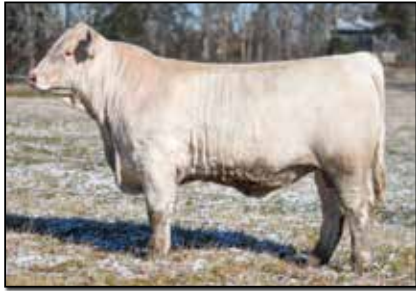
SON OF LOT 89 Sired by Resource