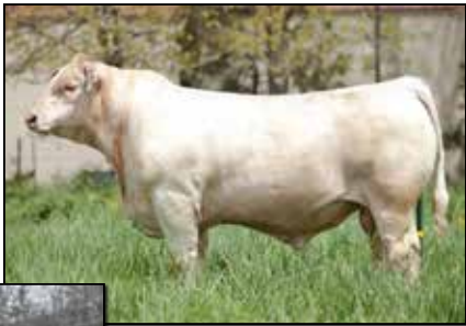
RF SC OUTER LIMITS 8222 Sire to Lot 88A