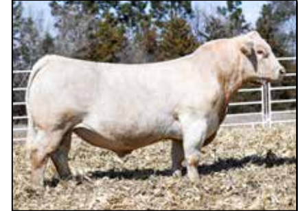
CCC WC RESOURCE 417 Sire of Lot 94

Calved 1-21-21 with RF Ledger 439 Bull Calf. Top 4% WW, Top 25% YW, Top 15% Milk, Top 2% MTL and Top 20% REA.