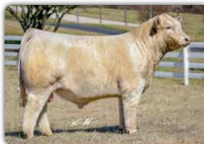
RRC I'M YOUR HUCKLEBERRY 511 Sire of Lots 34-35