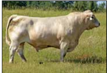
WC DOUBLETREE 2009 P Sire of Lots 95-96

PE to SJ Resource 1908 from 9-10-20 to 12-5-20. Consigned by 5J Charolais, Syracuse, Missouri