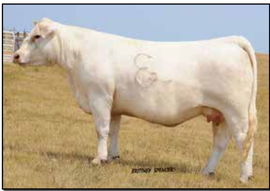
3G COWGIRL XQUISITE Dam of Lots 56-57

TR PZC MR ASSERTION 924 ET Sire Reg: EM782244 3G COWGIRL XQUISITE Dam Reg: EF1124646 OBG ASSERTION 4906 P ET THOMAS MS IMPRESSIVE0641 LT RIO BRAVO 3181 P SFC BABE 304 LT ASSERTION 1277 P ACE MS NANCY 1935 PET JWK IMPRESSIVE D040 ET BCI MISS VERYLIMIT 6033P LT RIO BLANCO 1234 P LT 7N OF DUKE 9083 PLD CARDINALS LAD B180P SFC MISS SUE 825