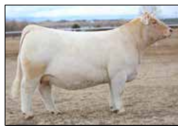
RF DUCHESS 631