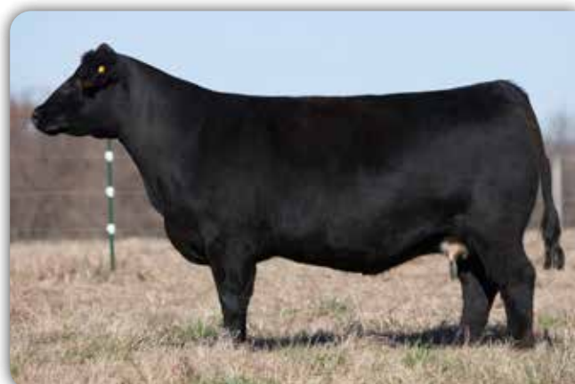
216Y DONOR Sons sell as Lots 49-52