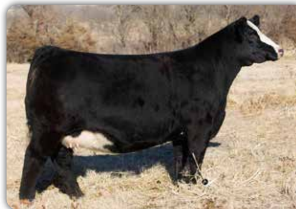
Full sister to Lots 53-55

SIRE LLSF PAYS TO BELIEVE ZU194 2659897 CNS PAYS TO DREAM T759 MLF BL JESSIE K336 DAM SIMME VALLEY ZIPPER 74Z 2672818 JF MILESTONE 999W GWS EBONY'S TRADEMARK 6N JBS ROCKIN ROBIN R194 TNT TOP GUN R244 MS MAXIE LOU M112S STF TOO RED G64 WAR DIVA M704 EPD CE BW VV YW MCE Milk Stay CW Marb BF REA API TI 7.3 3.1 79.4 118.9 3.1 21.7 11.9 21.1 0.12 -0.082 0.60 113.8 75.7