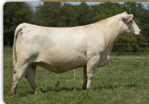
MATERNAL SISTER to Lot 1