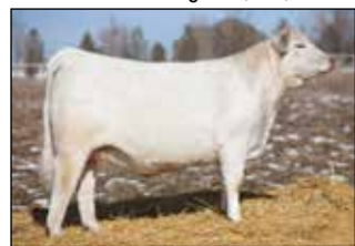
RF GRETA 96Z