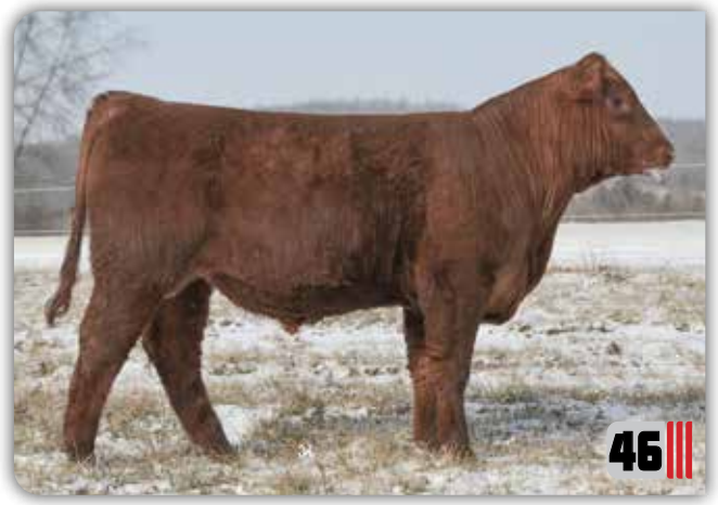
0310E DONOR Sons sell as Lots 46-47