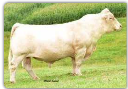
TR PZC MR ASSERTION 'GUNSMOKE' 924 Sire of Lots 32-33