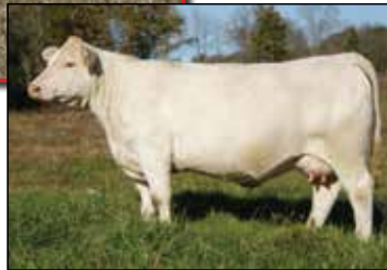
OW ASHLEE 0063

Calved 12-31-20 with Resource Bull Calf. Out of Ashlee 0063, the dam of 2010 Show Bull of the Year X-Factor. Top 25% YW, Top 5% Milk, Top 5% MTL and Top 8% Fat.