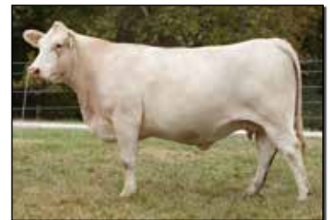
AC MS SOUTHERN SPICE Granddam of Lot 90

A square built female that is very attractive up through her shoulder and neck. A pedigree that is stacked with great donors and sires. Top 10% CE and BW, Top 20% Milk and Maternal, Top 25% REA.