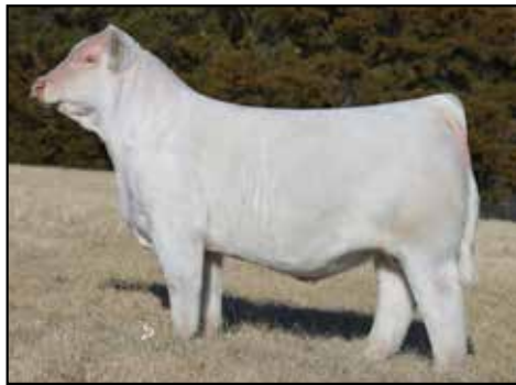
BOY OUTLIER Service Sire to Lot 89