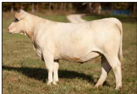
RF AGATHA 149 P Dam of Lot 60 as a Bred Heifer

Calved 12-27-20 with Outlier Bull Calf. Out of the Agatha Cow Family. A couple sons are working in TX and a daughter is retained in herd. Top 25% BW, Top 20% Milk and Top 5% MARB.