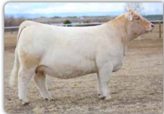
RF MS DUCHESS 631 Dam of Lot 2