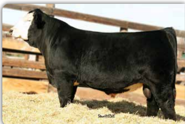
ONE EYED JACK Sons sell as Lots 49-52