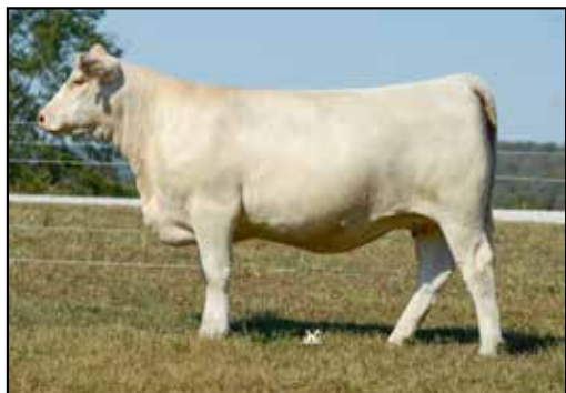
Daughter sold to Carr Cattle Company

Our pick out of the Aschermann Dispersal. A daughter sold to Carr Cattle Co. and several sons are working in OK and TX. We have had a great amount of success i mating Firemaker genetics to Bohannon. Top 20% WW, Top 10% YW, Top 8% TSI and Top 10% MARB.