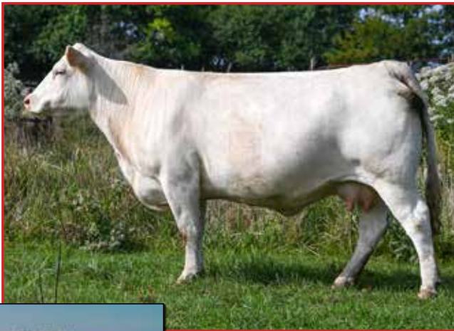
BC CLARICE 1601 P Flush Sells as Lot 74

Flush guarantee of 6 embryos and cap of 10. One of our young donor females from the great Clarice cow family. We selected her from Beavers Charolais at the Iowa Beef Expo as a yearling. We have offered her progeny in some sales and they have garnered a lot of attention. Her females are the kind that can be exhibited but will definitely perform in the pasture for you. She has been productive in the donor pen averaging over 12 embryos per flush. She will be ready to go following the sale. We will guarantee 6 embryos but cap it at 10. Don't miss out on this limited opportunity. Top 10% for BW, Udder and Teat; Top 15% for WW and MARB; Top 25% for YW and TSI. Consigned by 5J Charolais, Syracuse, Missouri